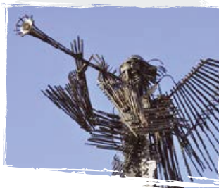
WORMWOOD STAR MEMORIAL