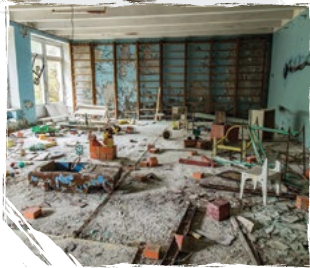
"GOLDEN KEY" KINDERGARTEN