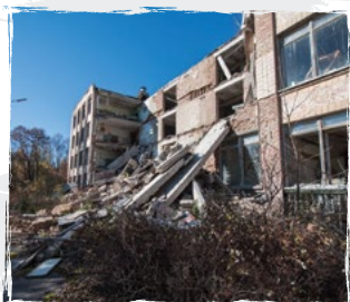
GRAMMAR SCHOOL #1