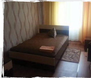
HOTEL "10" IN CHERNOBYL CITY