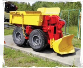
CHERNOBYL OPEN AIR MUSEUM OF MACHINERY