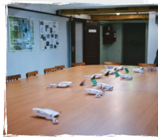
EMERGENCY CONTROL ROOM IN THE BOMB SHELTER