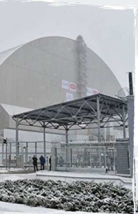
NEW SAFE CONFINEMENT