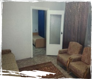
HOTEL "PRIPYAT" IN CHERNOBYL CITY