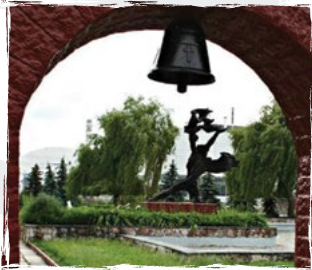
CHERNOBYL POWER PLANT MEMORIAL