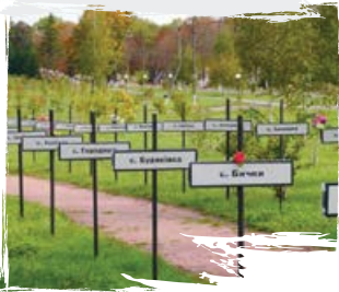
"ALLEY OF MEMORY AND HOPE"