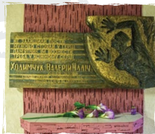
VALERIY KHODEMCHUK MEMORIAL