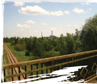
"BRIDGE OF DEATH"