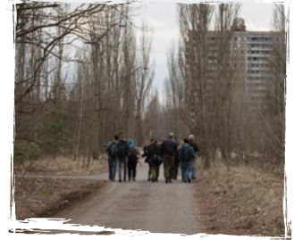
EXPLORING PRIPYAT STREETS