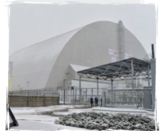
SAFETY SYSTEMS HQ