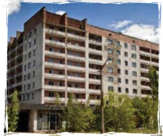
"RAINBOW" SHOPPING CENTRE