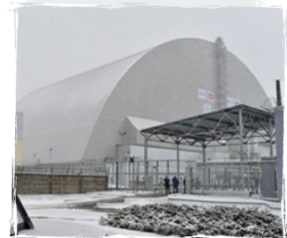
SAFETY SYSTEMS HQ