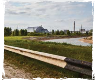
PANORAMA VIEW OF THE NUCLEAR POWER PLANT