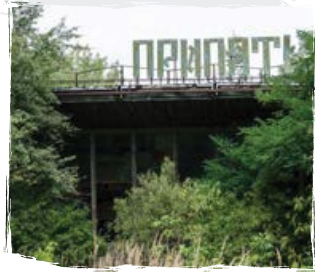
RIVERPORT AND CAFE "PRIPYAT"