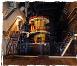
WATER COOLING CIRCULATING SYSTEM