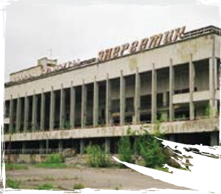
PALACE OF CULTURE "ENERGETIC"