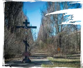
BOULEVARD OF LENIN