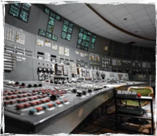
CONTROL ROOM #2