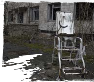
PRIPYAT HOSPITAL #126