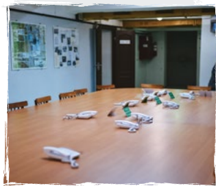
EMERGENCY CONTROL ROOM IN THE BOMB SHELTER